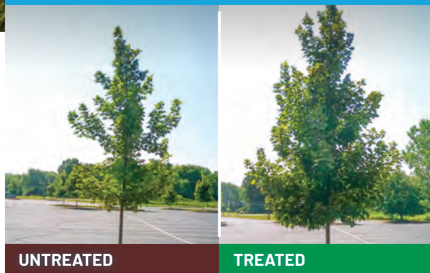
Two years post planting – Kent State University